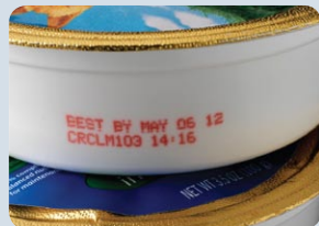
Ink jet on plastic tub