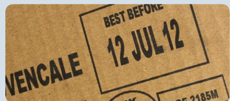
Large character ink jet on corrugate