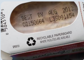
Ink jet on plastic film