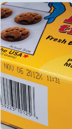
Ink jet on paperboard