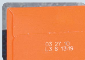
Laser on paperboard