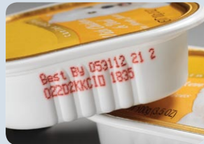
Ink jet on plastic tub