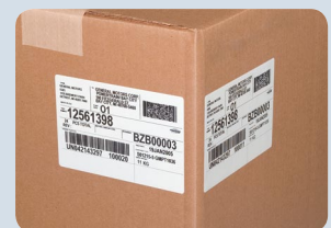
Label application on corrugate