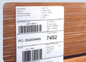
Label application on stretch wrap