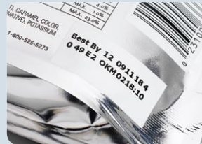
Thermal transfer (TTO) on pouch