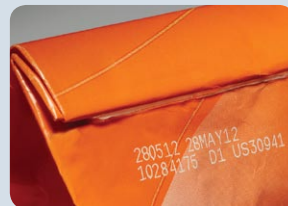
Laser on bag