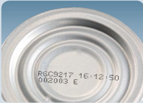
Ink jet on can