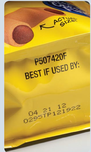
Ink jet on pouch